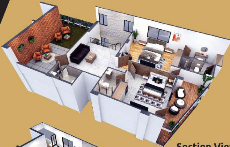
Section View Duplex Top Floor 4BHK