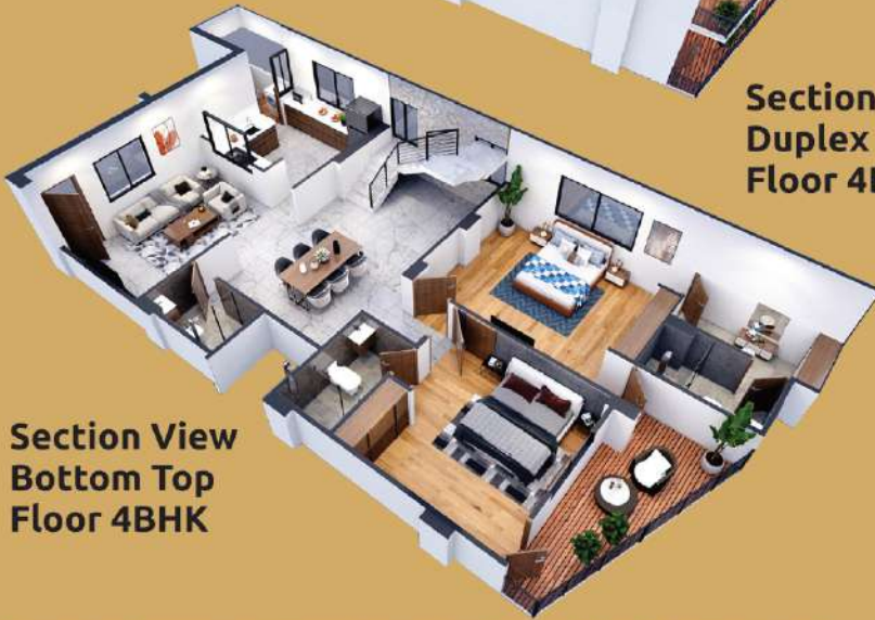
Section View Bottom Top Floor 4BHK